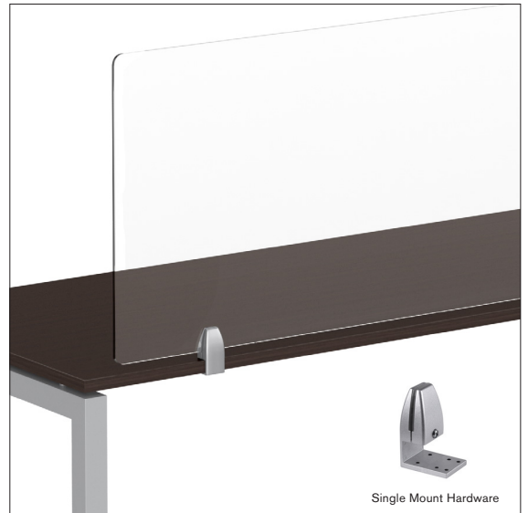
Single Mount Hardware

Keep up physical distancing protocols around your workspaces with this clear acrylic desk mount panel. It's 24" high, and is available in widths ranging from 24"-72". It easily installs into the desk mounts (shown below) to sit on top of the desks. Available in clear acrylic.